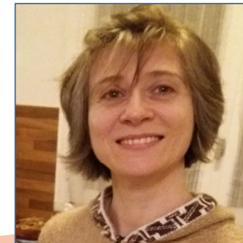
Chiaro Marmo (start in sept)